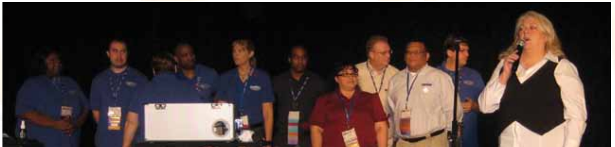
Committee of the Year: Conference Committee